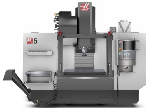
The Haas VF-5 CNC Machine.

ahead of the current line of code to process the next move before it happens. This is ideal for parts with long 3D contour operations.